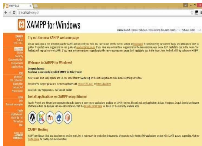
Figure B2.1 Local host Window

Step 9: Type local host on your browser and press enter