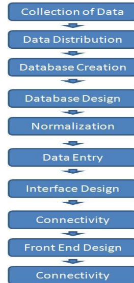
Figure c. Workflow Diagram.