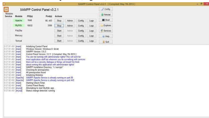
Figure B2: XAMPP Control Panel

Step 8: Installation is now complete! Select the 'Do you want to start the Control Panel now?' checkbox to open the XAMPP control panel (Fig B2).