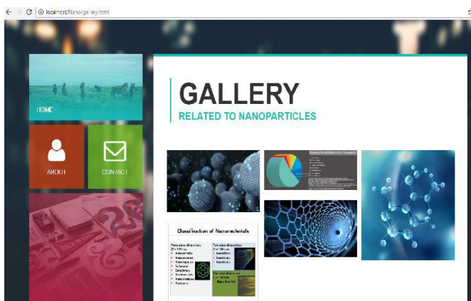
Figure C6.1 Gallery of Nanoparticles